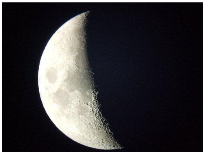
Moon on 9/24