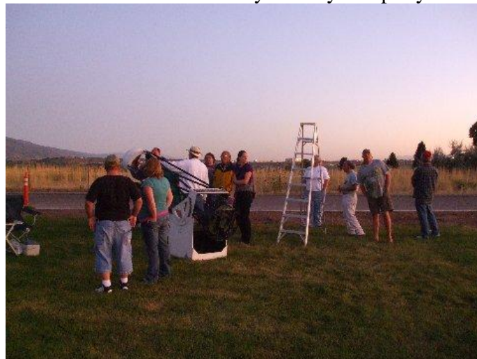
Guests at the Pleasant Valley Library star party