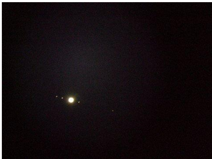
Jupiter & the Galilean Moons. 9/24