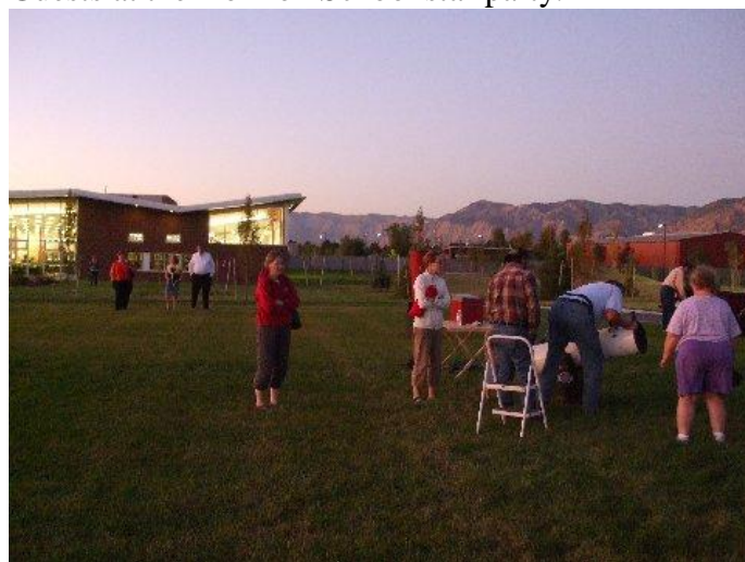
Guests at the Pleasant Valley Library star party