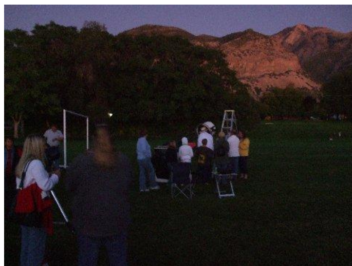
Guests at the Horizon School star party.