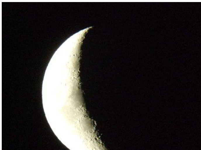
Moon on 9/23